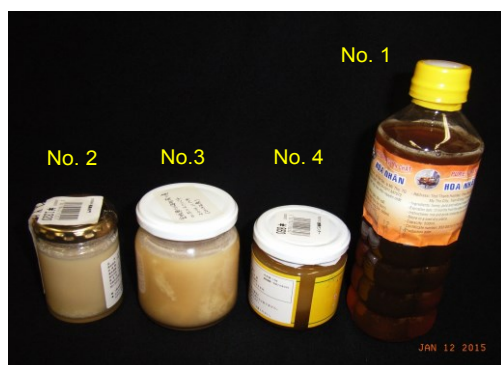
Fig. 1. Photographs of honey specimens after storage in a refrigerator for one month. No. 1, Longan honey ; No. 2 honey from Kyoto Prefecture, Japan; No. 3, honey form Miyagi Prefecture, Japan; No. 4 honey from Hokkaido, Japan

Four honey specimens were subjected to HPLC analysis to know their sugar composition. Fig. 2 shows