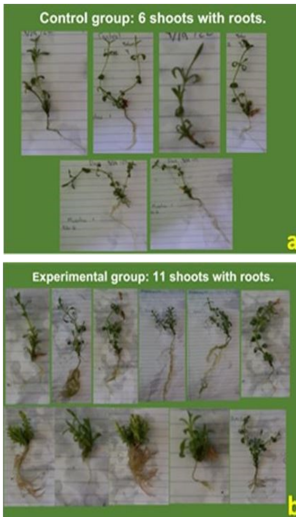
Fig. 3. Images of the shoots that developed roots of the control group (a), and the experimental group (b).

Subsequently, the lengths of the shoots were measured with the help of a stereoscopic microscope, and photos were taken of the shoots that developed roots before being transplanted to a mixture of substrate (Fig. 3).