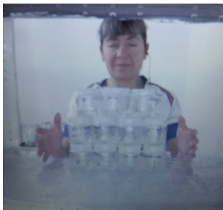
Fig. 1. The experimental group receiving the qi treatment.

1). The experimental group jars were separated from the control group while receiving the treatment. Later they were placed in the same place next to the control group.