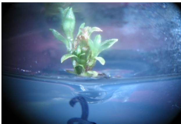
Fig. 2. Shoot with depression in the culture medium.

Five weeks after starting the cultures and the treatments, and due to the administrative vacations of the University, it was decided to conclude the research protocol. Observations were made in both groups, counting the number of shoots that developed roots and the number of depressions in the culture medium (Fig. 2) (Table 1).