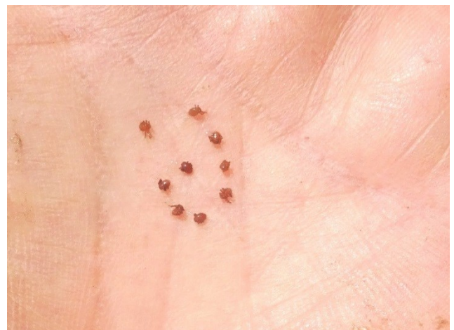
Fig. 2. Nine Braula coeca adults collected from one queen.