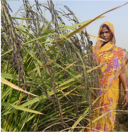
Kalanamak KN3 (Tall)