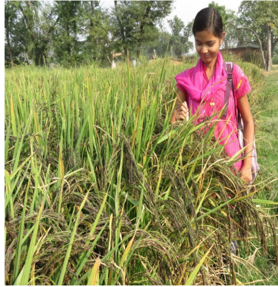
Bauna Kalanamak 102 (Semi-dwarf)