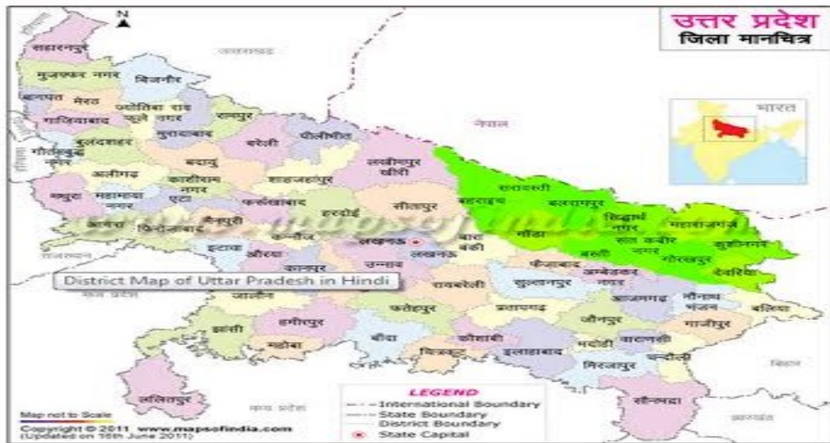
North-East plain zone of U.P. (highlighted in light green)